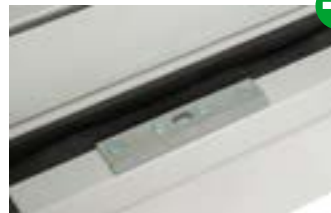
innovative door locking at top and bottom