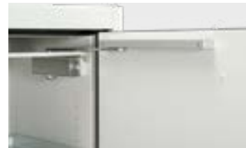
Door closing mechanism with door locking mechanism

The PROline series meets the current DIN EN 14470-1 standard, making it even safer and more practical. In a fire chamber test at an accredited test institute, this secure cabinet achieved perhaps the